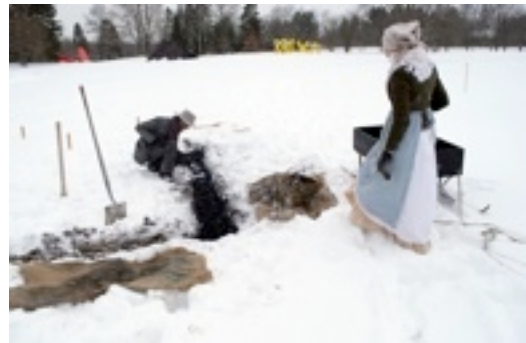
McCaw and Budsberg, Coal and Ice performance/ installation 2011

Shana McCaw, Adjunct Faculty in Foundations and Fine Arts , and Brent Budsberg, 3-D Lab Supervisor, exhibited four large-scale photographs and two drawings in the gallery at the Lynden Sculpture Garden. They also created a daylong performance that resulted in a temporary outdoor installation on the sculpture garden grounds. The works were part of Lynden's "Inside/Outside" series.